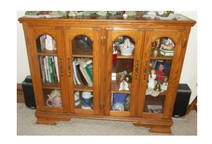
Oak 4 glass door bookshelf/China cabinet