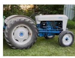
1955 Ford 800 wide front w/5 speed transmission, live PTO, serial # 13555