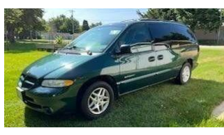
1999 Dodge Grand Caravan Sport – has some dents – 111,227 miles