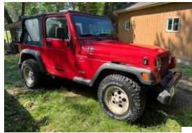
1996 Jeep Wrangler Sport – 4.0 liter – some rust