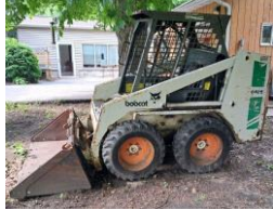
Melrose Bobcat – Model 642B gas skid loader w/bucket Serial# 5040-M-26225. 2645 hours