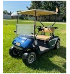
2005 EZ-GO 60 Freedom SE electric golf cart – 27647-601 VIN 2339172